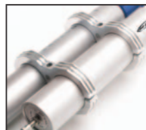
Billet Reservoir Clamps— See page 60